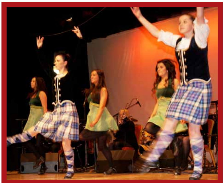
Irish and Scottish dancers in unison on stage at the Craigavon Civic Centre Good Relations launch

The whole evening has since been commended as an outstanding event, a most fitting launch to the Good Relations Programme, and acclaimed by international observers as an outstanding presentation.