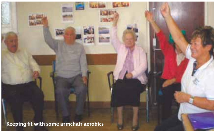
Keeping fit with some armchair aerobics

"We enjoy our games and meetings, which allows us to play games with friends. One of our games is called Rummikubu, which is very interesting. We also enjoy a friendly chat and exercises. We look forward to our meetings on Tuesdays and also our annual outings."