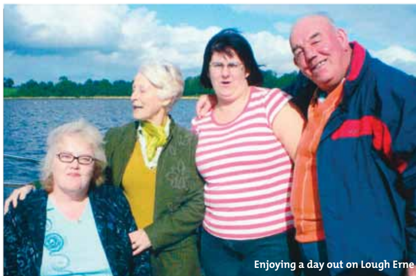
Enjoying a day out on Lough Erne